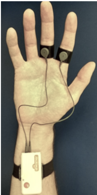
Figure 4: Skin conductivity monitor

player and acting as a reward for continued participation [39, 17]. Several studies show the ergogenic effect of music in sports and high intensity exercise performance by shifting attentional focus away from agonising exercise induced bodily sensations [5, 3, 2, 21]. Motivational tracks include a high tempo beat over 120 beats per minute and a strong rhythm to enhance energy and induce bodily action [20]. Based on these studies we evoked underwhelming, overwhelming and optimal states in high intensity VR exergames by varying the aesthetics and gameplay.