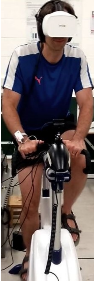
Figure 1: Players exert themselves on an exercycle